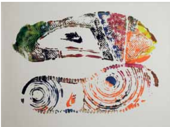
Take money and run, 2011 akrilik na platnu / acrylic on canvas, 40 x 30 cm