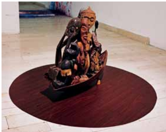
Nekulturni / Uncultural ones ready-made instalacija / installation