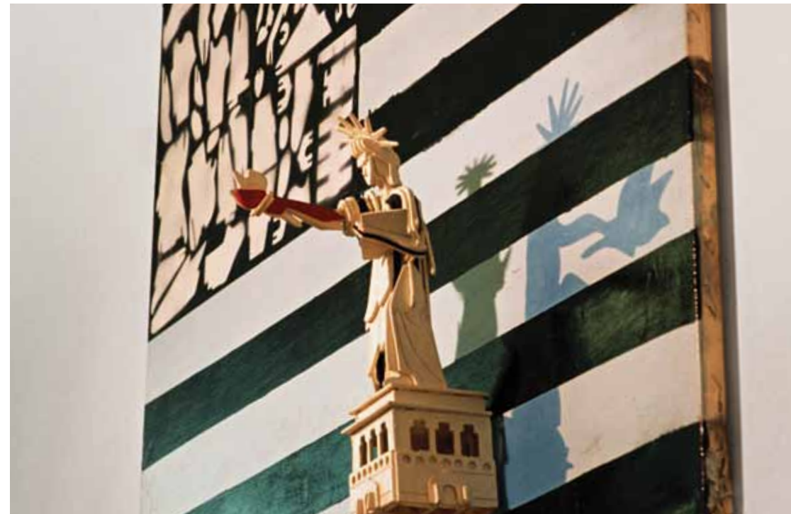
Made in China, 2009 - 2011 kombinovana tehnika / mixed media, 75 x 100 cm objekti od kartona / paper objects