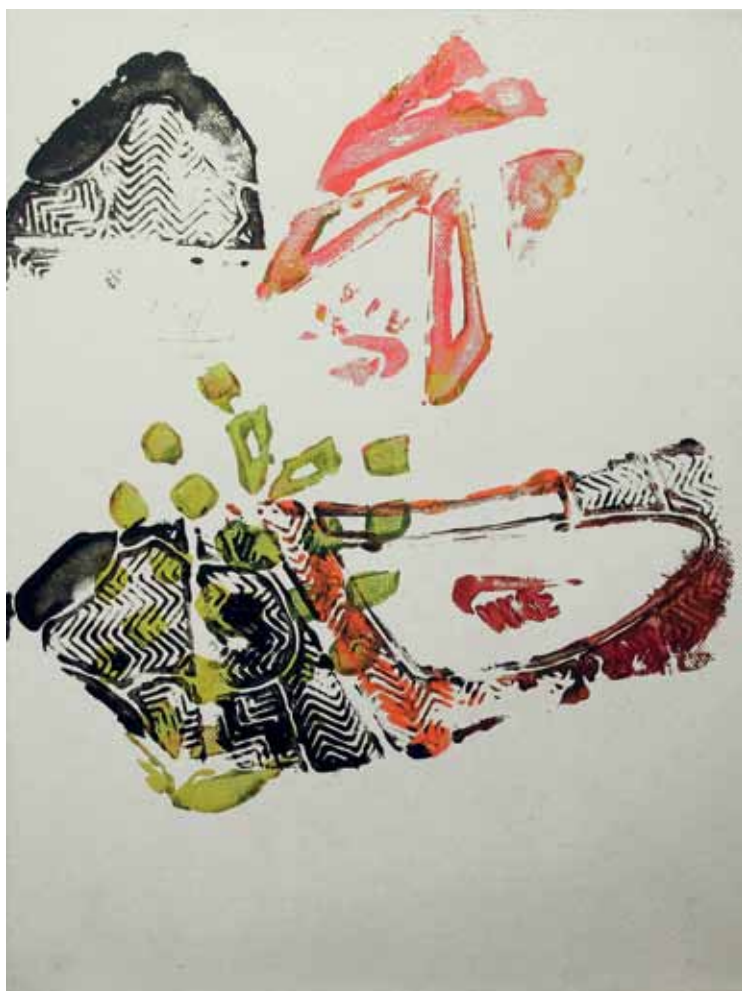
Ubij, ubij / Kill, Kill, 2011 akrilik na platnu / acrylic on canvas, 40 x 30 cm