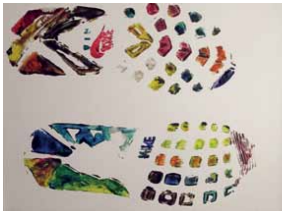
London burning, 2011 akrilik na platnu / acrylic on canvas, 40 x 30 cm