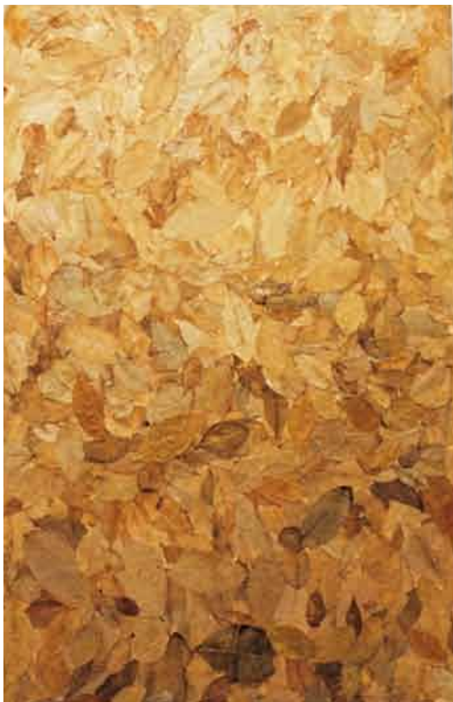
Ikokana, 2011 lišće koke na dasci, 60 x 40 cm ulje na platnu, 85 x 80 cm

Kada sam preprošle godine letovo u Maču Pikču saznao sam da je taj grad imao kanalizaciju dizajniranu tako da se u nju vršila samo mala nužda , a za veliku odlazili su u šumu i defekaciju vršili u male jame iskopane u Pača Mami (vrhunsko božanstvo Inka) sve vreme grickajući koku ili pijući čaj od Koke (sveta biljka svih Južnoameričkih indijanaca).