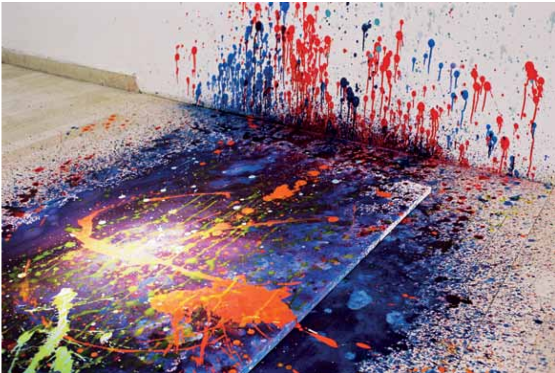
sprich mich , event

Zon Moderna je edukativno-umetnički projekat Muzeja moderne umetnosti iz Stokholma, koji je namenjen učenicima srednjih škola i njihovom uključivanju u umetničke procese.