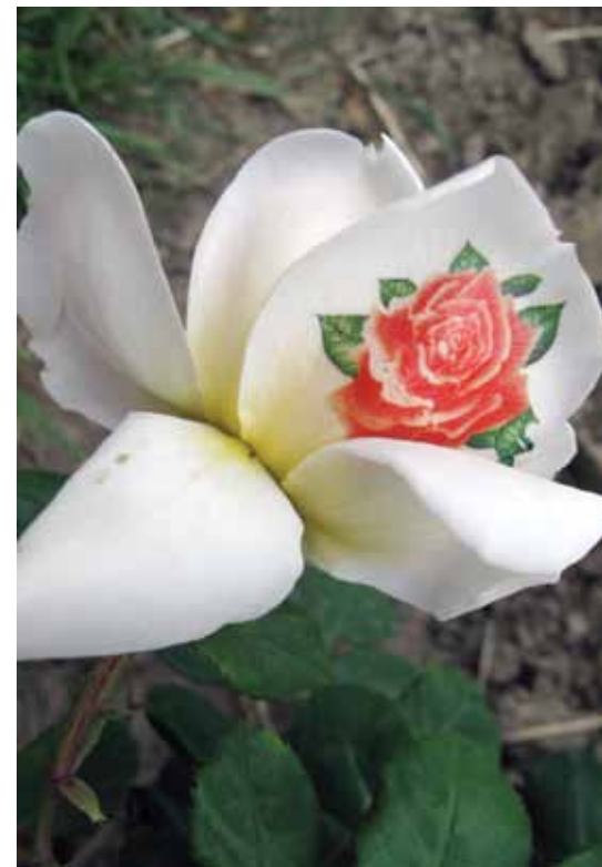
Ruže za Seksi Koru, 2011

Seksi Kora (2. maj 1987 - 20 januar 2011) je bila porno zvezda u usponu i nesrećno je umrla tokom šeste operacije uvećanja grudi. Surfajući internetom osetio sam čudnu povezanost i simpatiju prema ovoj devojci koja se još više uvećala kada sam saznao da je ona u pokušaju da obori rekord u oralnom seksu, u parku u Hamburgu popušila više od 70 kuraca fanova i prolaznika, i tom prilikom više puta ostajala bez svesti usled nedostatka kiseonika. Policija je rasterala ovaj skup i iako rekord nije bio oboren ovo je dosta važan performans u savremenoj umetničkoj produkciji u kojem je spojeno nasleđe u našim krajevima omiljenog nemačkog žanr filma i radikalnog performansa. Posebno sam bio uzbuđen kad sam saznao da živim u delu Berlina, Pankowu u kome je ova glumica rođena.