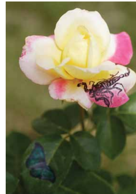
Roses for Sexy Cora, 2011.

Seksi Kora (2. maj 1987 - 20 januar 2011) je bila porno zvezda u usponu i nesrećno je umrla tokom šeste operacije uvećanja grudi. Surfajući internetom osetio sam čudnu povezanost i simpatiju prema ovoj devojci koja se još više uvećala kada sam saznao da je ona u pokušaju da obori rekord u oralnom seksu, u parku u Hamburgu popušila više od 70 kuraca fanova i prolaznika, i tom prilikom više puta ostajala bez svesti usled nedostatka kiseonika. Policija je rasterala ovaj skup i iako rekord nije bio oboren ovo je dosta važan performans u savremenoj umetničkoj produkciji u kojem je spojeno nasleđe u našim krajevima omiljenog nemačkog žanr filma i radikalnog performansa. Posebno sam bio uzbuđen kad sam saznao da živim u delu Berlina, Pankowu u kome je ova glumica rođena.